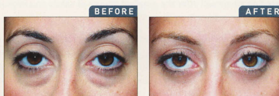
Lower blepharoplasty with lateral reticular canthoplasty. Procedure performed by Steven Fagien, MD; Boca Raton, FL.

WHAT YOU'LL NOTICE | When swelling and bruising begin to subside, you'll start to see smoother, less puffy under-eye skin. However, your appearance will continue to refine over the coming weeks and months. The final results can turn back the clock on your appearance by about eight to 10 years.